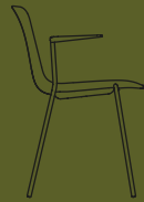
4 LEGS WING ARMS W 605 H 775 D 525