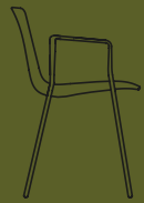
4 LEGS ALUMINIUM/STEEL ARMCHAIR W 555 H 775 D 525