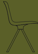
SPIN W 462 H 775 D 525