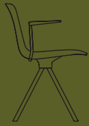
SPIN WING ARMS W 605 H 775 D 525