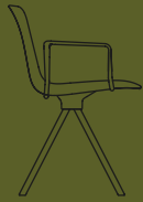
SPIN ALUMINIUM ARMS W 605 H 775 D 525