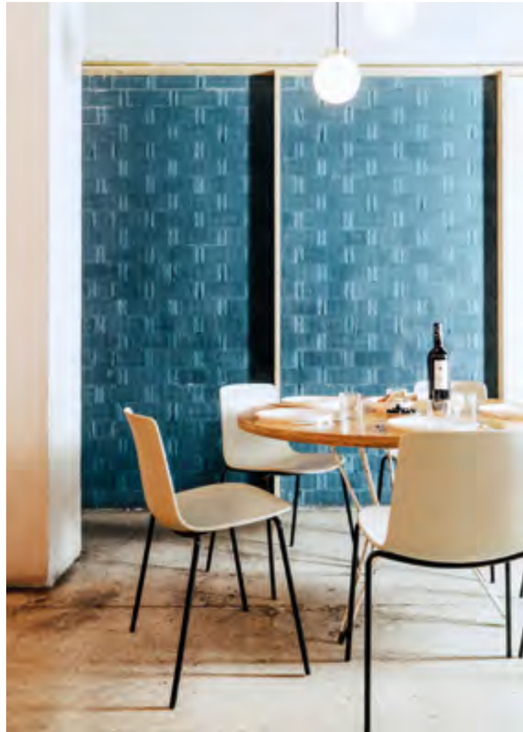
Lottus chair (ref. 4801) with RAL 7032 polypropylene shell and structure lacquered in RAL 9005.

Su curvatura natural, producto de la excelencia de su diseño, se ubica cómodamente entre la formalidad y el confort.