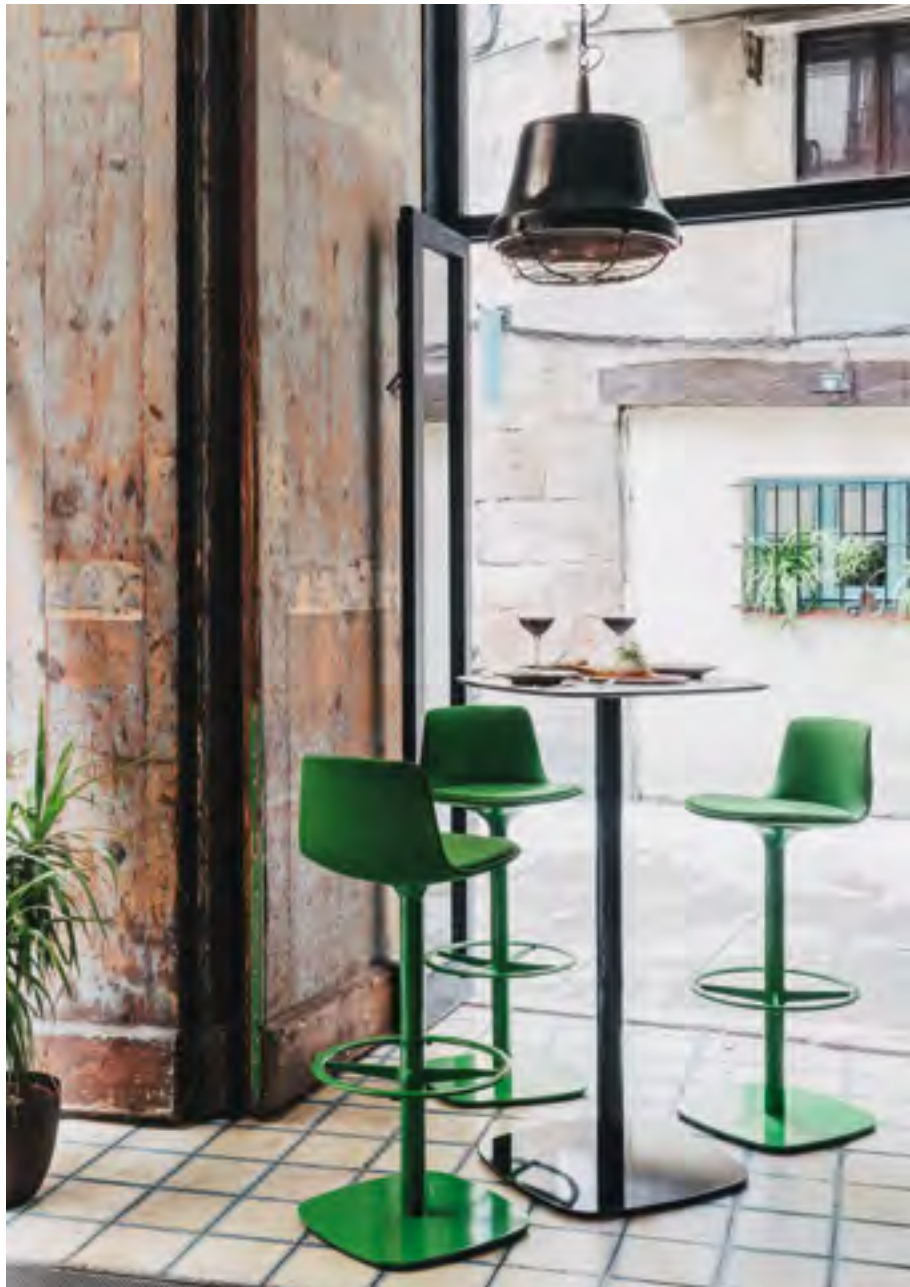
Lottus stool (ref. 4700) with a structure and PP shell in custom colour and pad upholstered with Lottus table.