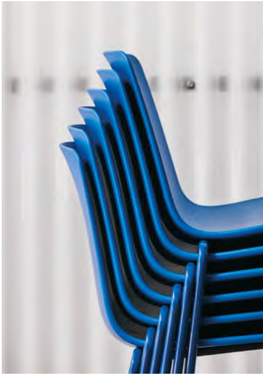
Lottus chair (ref. 4801) in custom monochrome colour.

PAPE+ROHDE b ü r o e i n r i c h t u n g e n