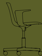
OFFICE CHAIR WOODEN ARMS W 612 H 790-920