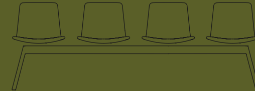
2/3/4/5 PLACES W 1034/1604/2174 H 775 D 516