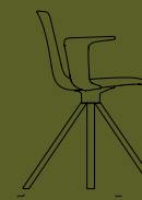
SPIN WOODEN ARMS W 605 H 775 D 525