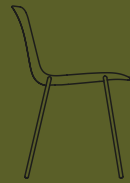
4 LEGS W 530 H 775 D 525