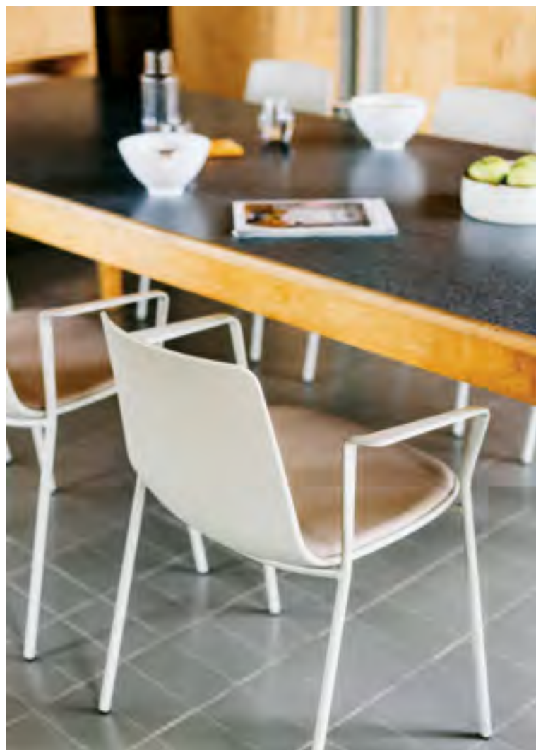
Lottus chair (ref. 5500) lacquered in RAL 7032, shell in RAL 7032 polypropylene and pad upholstered in Blazer CUZ47.

La línea sencilla y la esencia de Lottus se adaptan con estilo a los distintos espacios.