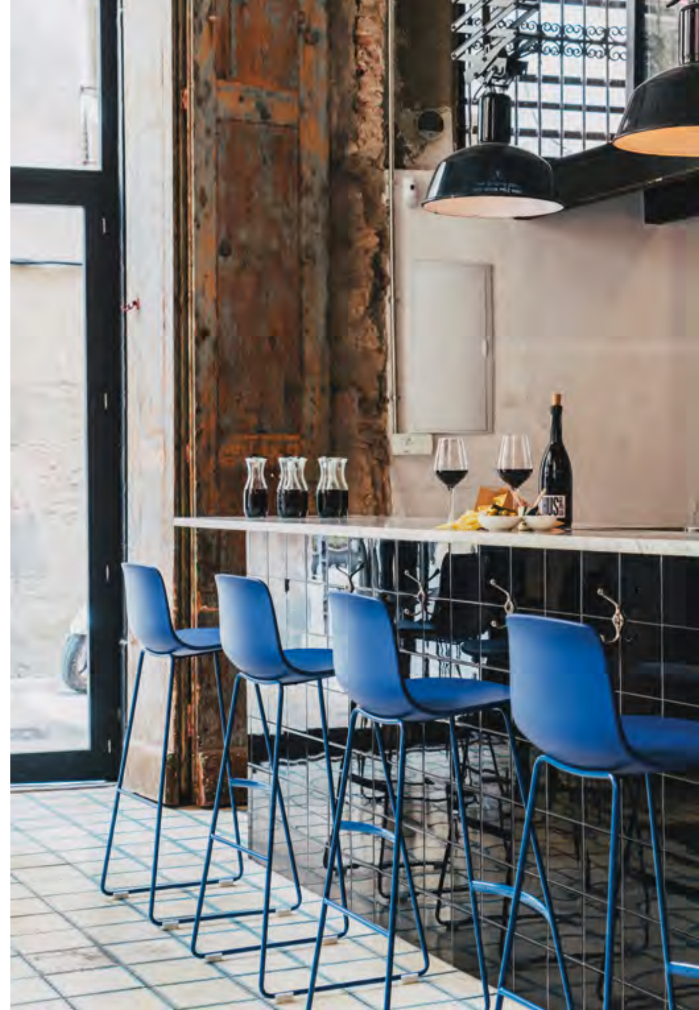
On the right: Lottus stool (ref. 4752) in Pantone 7545C monochrome.